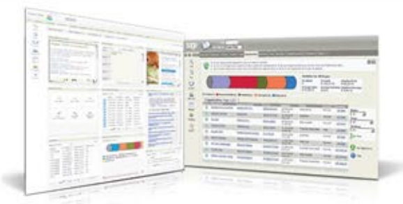
Sage CRM Interactive Dashboard and Sales Opportunity Management

Deliver Highly Effective Marketing Campaigns Ensure customers receive the right marketing message at the right time, improve marketing campaign response rate, enable marketing budget to be tracked and managed, and enable accurate measurement of marketing campaign ROI