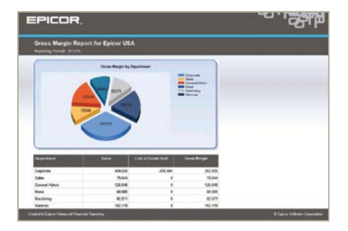
Manage, report, and distribute financial information securely.

AFR creates reports using the elements familiar to an accountant or financial professional. These include spreadsheet terms such as rows and columns. It also provides an additional element of reporting hierarchy or trees allowing the viewer to generate the report for the area of the business which is their responsibility. Because the reports are parameter driven, the viewer can generate the report at any time by selecting the parameters of time, company, book or organizational element as required without the need for intervention by the financial team.